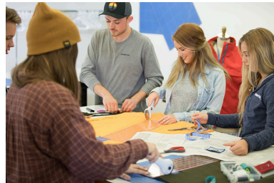
Summer Market Kicks Off