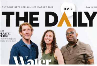
Outdoor Retailer Magazine

Page 32 , Page 63 , Page 76 , Page 54 , Page 64