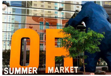
University's Outdoor Product