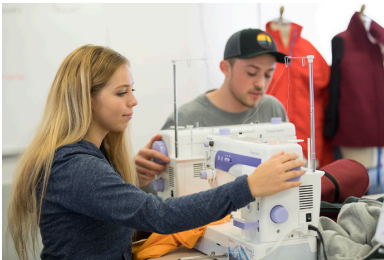
Design students invited to bags