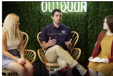
Market to showcase Denver