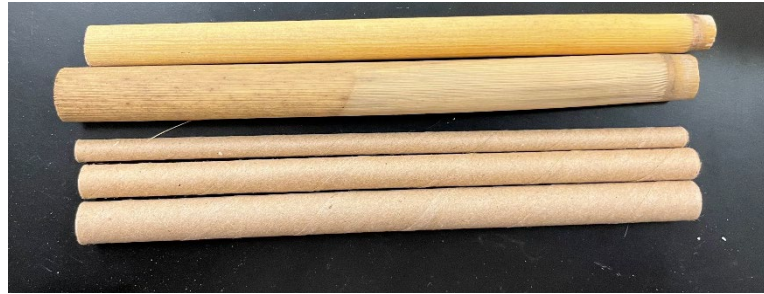
Figure 6. Various Reed Tube Sizes for Bee Homes