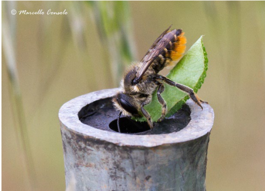
Figure 1. Leafcutter Bee