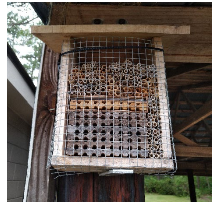
Figure 5. Bee Home Affixed With a Zip Tie