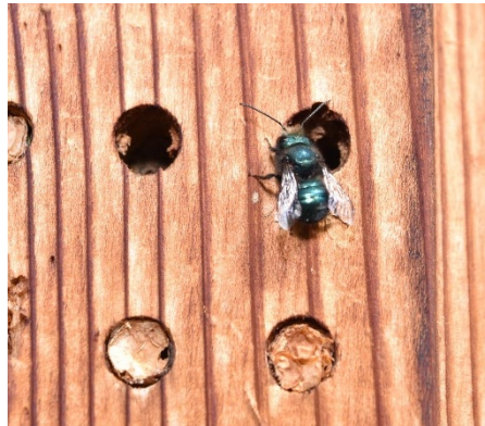
Figure 2. Mason Bee