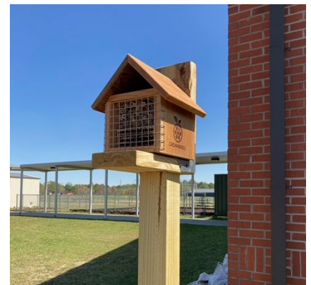
Figure 4. Bee Home Installed on a Sturdy Post