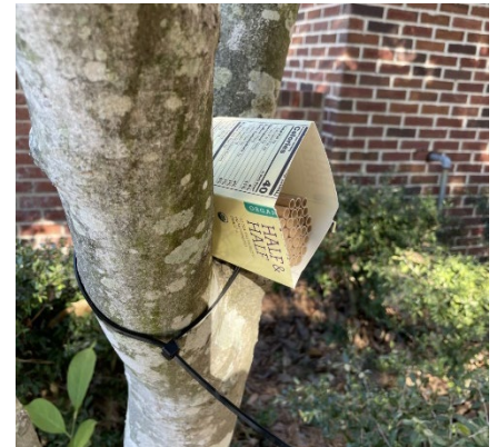
Figure 3. Bee Home Made From a Milk Carton